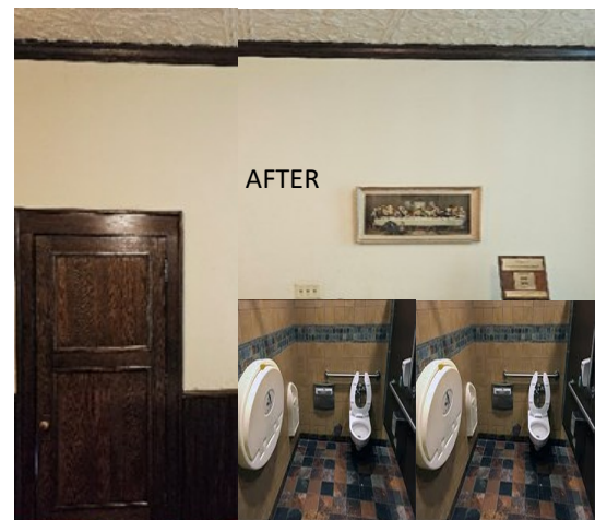
New Bathroom: New electric and new lights; Two handicapped Stalls; Folding Doors are closed and a new wall is built.