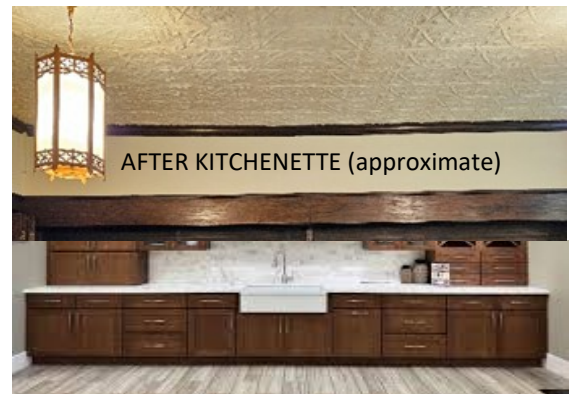
New Kitchenette against the wall of the Bathroom