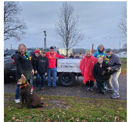
Not a Concert, But People Celebrating Jesus

Can you see it now? Christians talking with people about Jesus at an outdoor concert. Sign up for these events will start soon. Let's proclaim Jesus to our community!